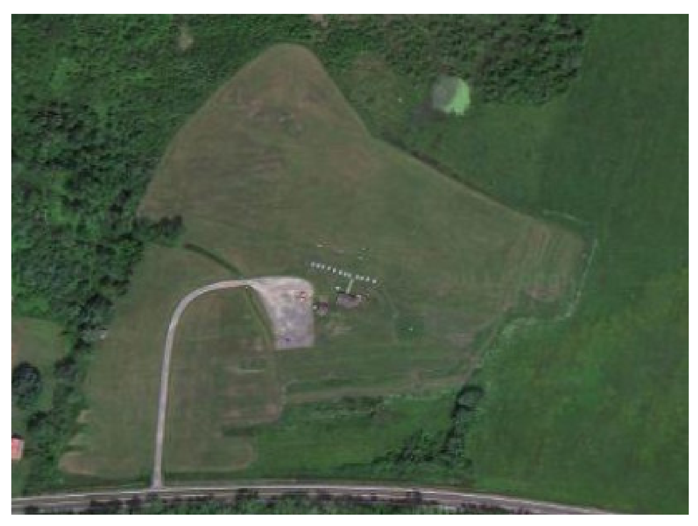
STARS Field Satellite photo